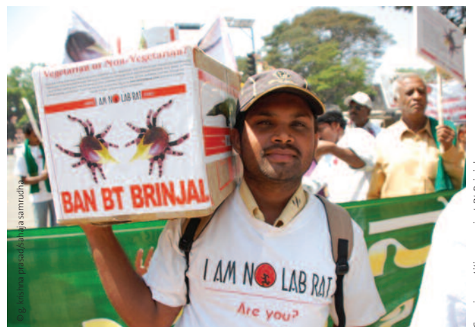
Carrying petitions against Bt Brinjal.