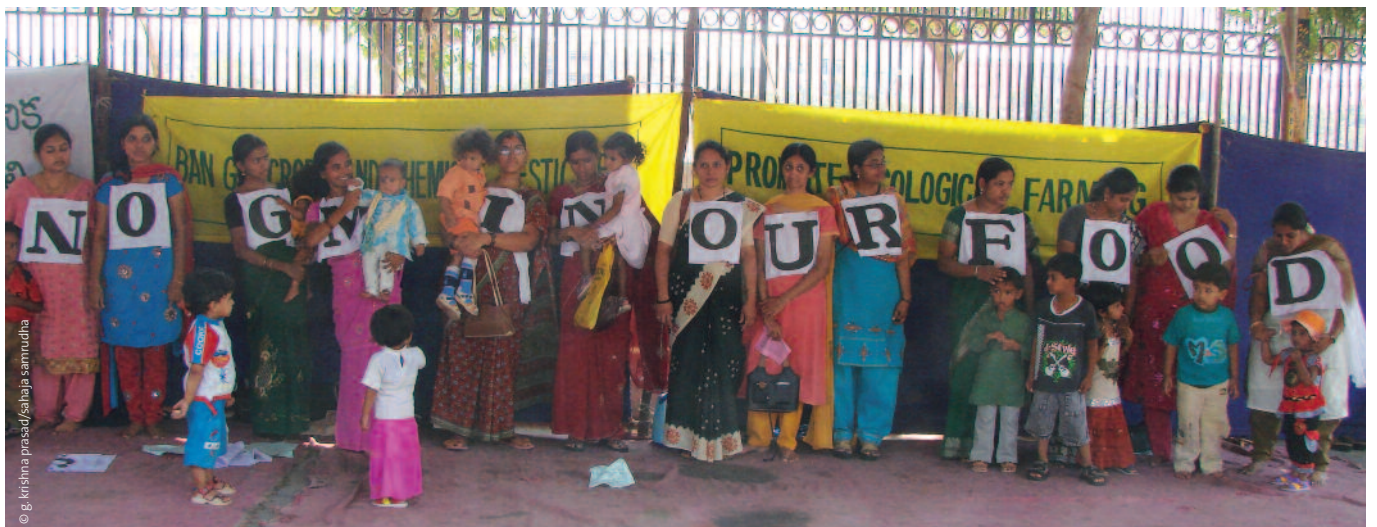
Mothers against GM food, India.