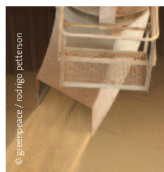
Production of soy bean flour, Brazil