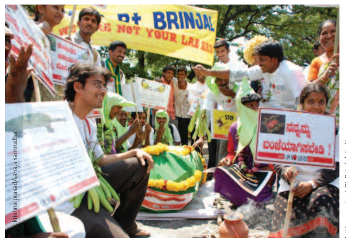
Action against Bt Brinjal, India.