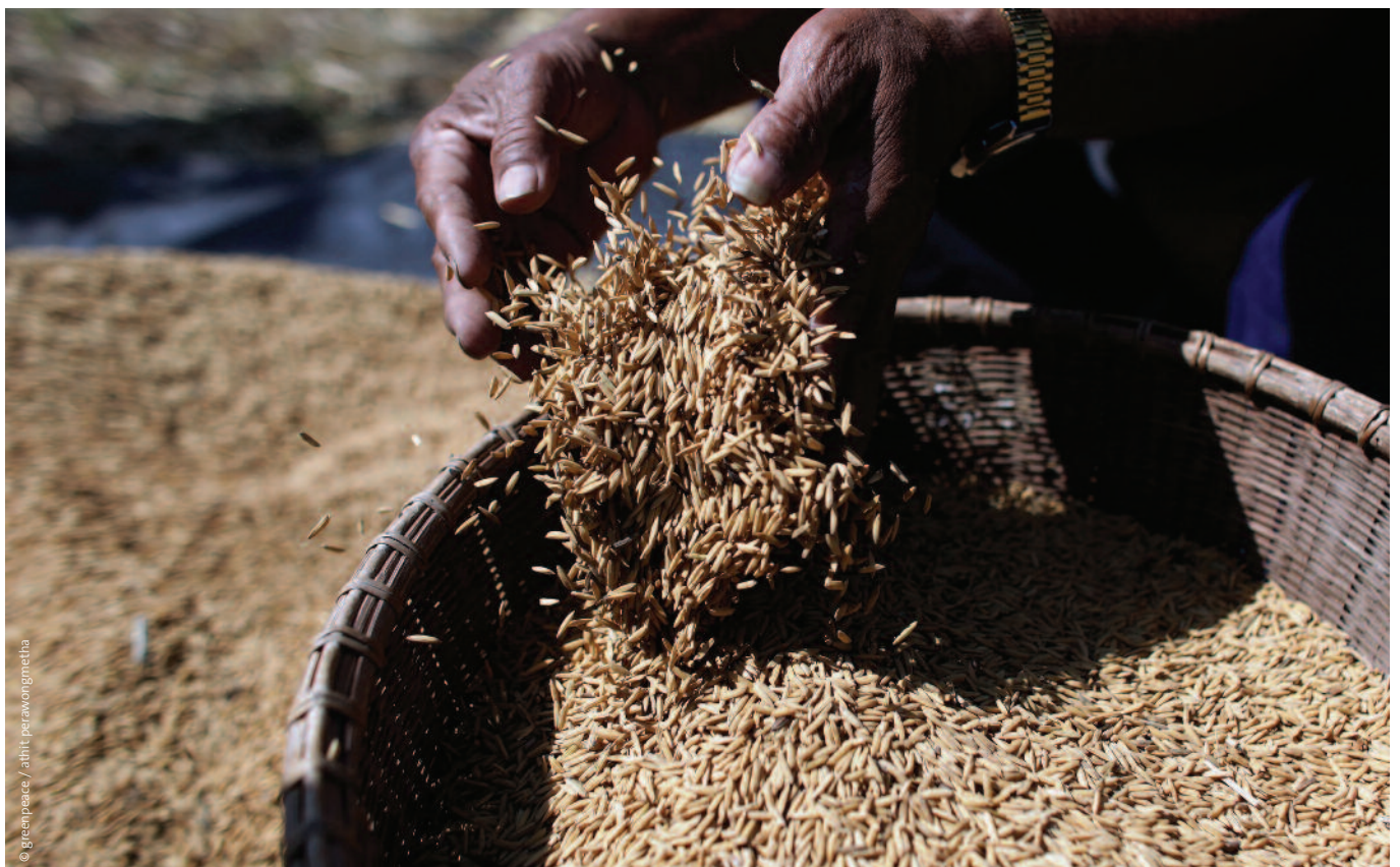
Harvesting organic rice

Food sovereignty puts those who produce, distribute and consume food at the heart of food systems and policies, rather than the demands of markets and corporations. It defends the interests and inclusion of the next generation. It offers an alternative to the current trade and food regime, and directions for food, farming, pastoral and fisheries systems determined by local producers. Food sovereignty prioritises local and national economies and markets and empowers peasant and small-scale sustainable farmer-driven agriculture, artisanal fishing, pastoralist-led grazing, and food production, distribution and consumption based on environmental, social and economic sustainability.