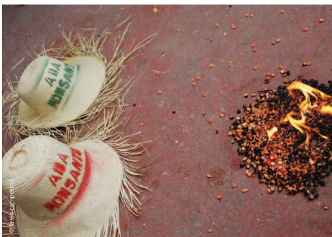
Haitian protests against Monsanto and GMOs.