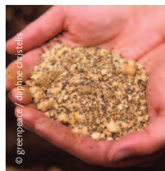
Feed for dairy cattle.