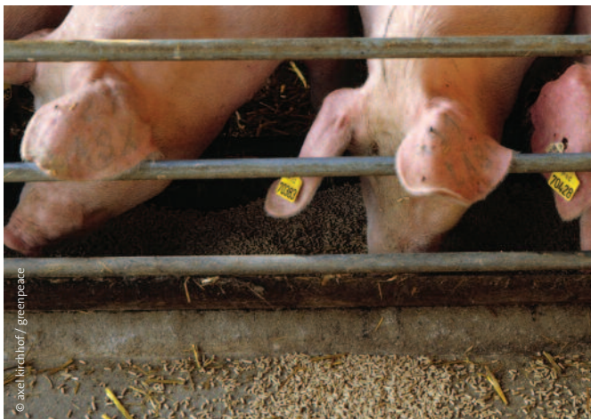
Pigs feeding on animal feed that contains GM soya beans.

This 70-page decision was reached after arguments were considered from both patent owners and their opponents, concerning attempts to patent the biological processes of tomato and broccoli plants. This decision delivers a major blow to the biotech corporations, who have been using broad legal definitions of patents to gain control over farming and the food chain. Nevertheless conventionally bred plants and animals can still be patented in Europe, since the EPO decision only excludes processes for breeding; it does not concern itself with patents on plants and animals more generally. Still, this is a success for the international coalition against patents on seeds, which is supported globally by over 300 NGOs and farmers' organisations. 34