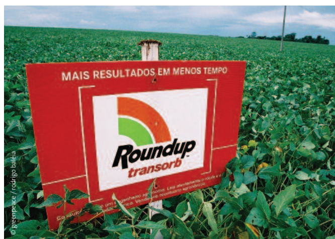
Soya field with Roundup transorb label, a herbicide produced by the US company Monsanto, Rio Grande do Sul, Brazil.