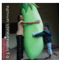
Children hugging a brinjal, India.

Seed corporations like Monsanto and Bayer are also carrying out field trials on herbicide tolerant cotton and maize, despite the superweed crisis that has unravelled in the USA. 165