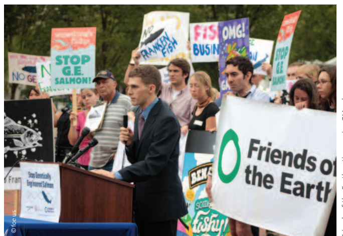
Friends of the Earth action against GM salmon in front of the White House, USA

The main argument for such a GM pig is to protect water resources. Run-off from pig manure that contaminates water is an expensive problem faced by large-scale, industrial hog producers. These ‘enviropigs’, if approved, would allow the few giant hog production corporations that run factory farms to continue to raise large numbers of pigs, fed on grain, in small confined areas.