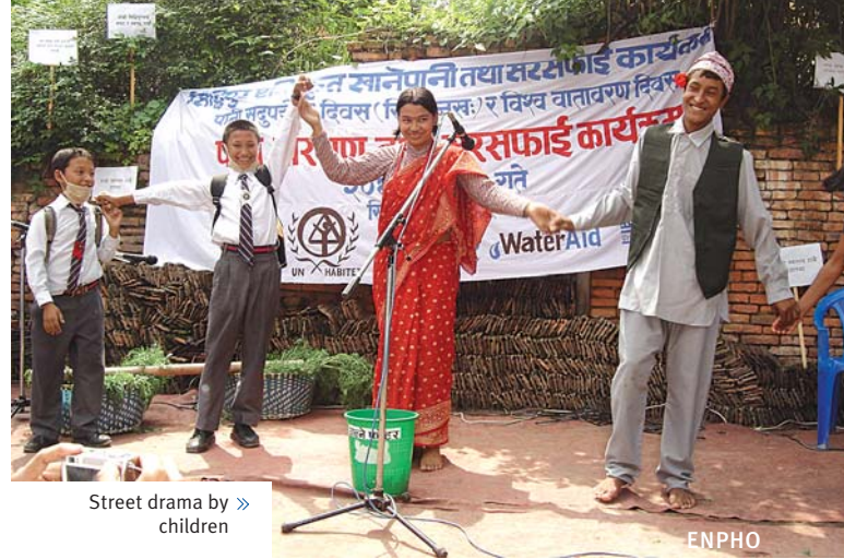
Street drama by children

management. In most cases, the involvement of private sector has been in the form of management contracts where a private contractor is given the responsibility of collecting waste from a certain area for a fixed fee. This is the simplest form of PSP whereby the responsibility for waste collection or transportation is given to a private party and it usually does not involve collection of service fee from waste generators. This form of PSP may reduce the cost of waste management to a certain extent but it requires effective monitoring by the municipality. In some municipalities, such as Hetauda and Kathmandu, franchise system of PSP has been introduced, whereby a private company is given the responsibility to collect waste as well as service fee from waste generators in a designated area such as a ward. This form of PSP usually results in less cost for the municipality and the service provider becomes more accountable to the people. Another form of PSP is the concession system whereby private sector