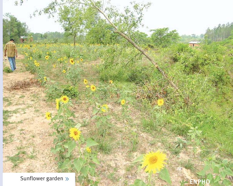
Sunflower garden »