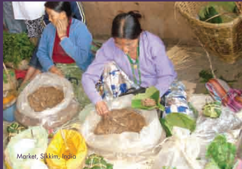
Market, Sikkim, India

In the light of the above, it has become apparent that a regional cooperation framework for access and benefit sharing from genetic resources in the Hindu Kush-Himalayan region could be beneficial for all the countries concerned, and also for the region's indigenous, marginalised, and local communities. ICIMOD, in collaboration with the CBD focal points of the regional member countries, has initiated development of such a regional cooperation framework. The objective is to preserve the biological and cultural diversity of the Hindu Kush-Himalayan region, to promote the use of its biological resources in ways that are sustainable and equitable, and to promote human wellbeing and security through the maintenance of ecosystem functions and integrity facilitated by access and benefit sharing. The draft regional cooperation framework was presented at the 14th meeting of the CBD Subsidiary Body on Scientific, Technical and Technological Advice (SBSTTA) in Nairobi in 2010; with participation of representatives from the countries of the Hindu Kush-Himalayan region. The draft is currently being debated and discussed with a view to adoption and implementation.