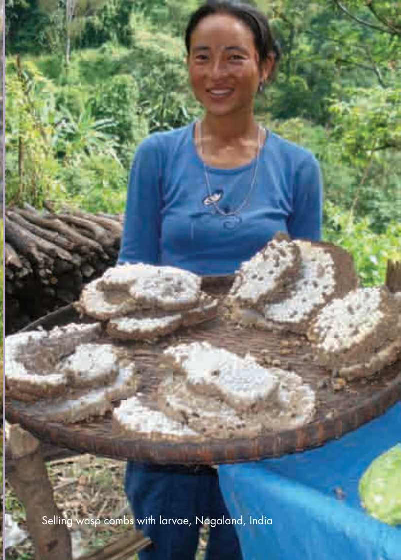
Selling wasp combs with larvae, Nagaland, India