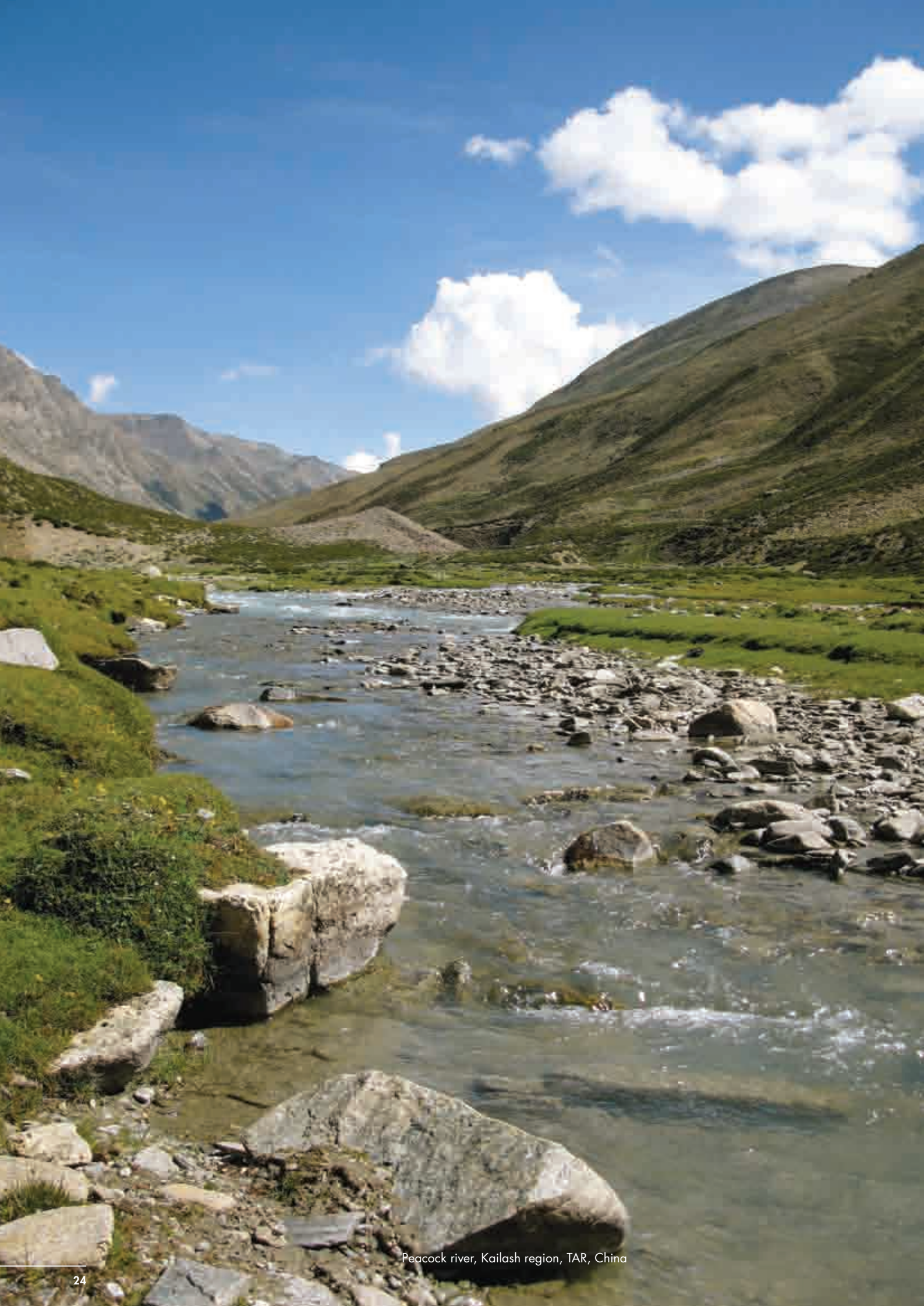
Peacock river, Kailash region, TAR, China