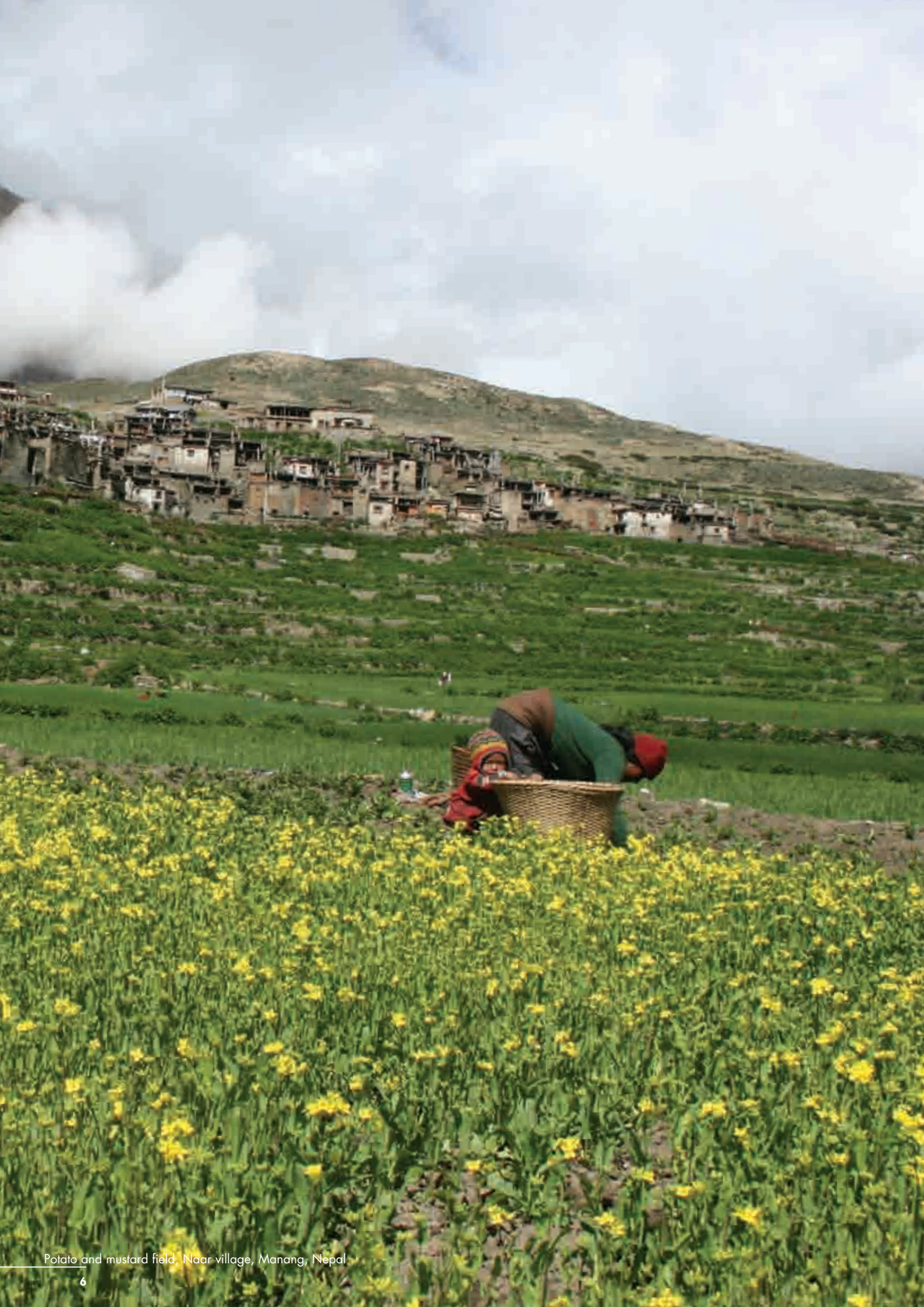
Potato and mustard field, Naar village, Manang, Nepal