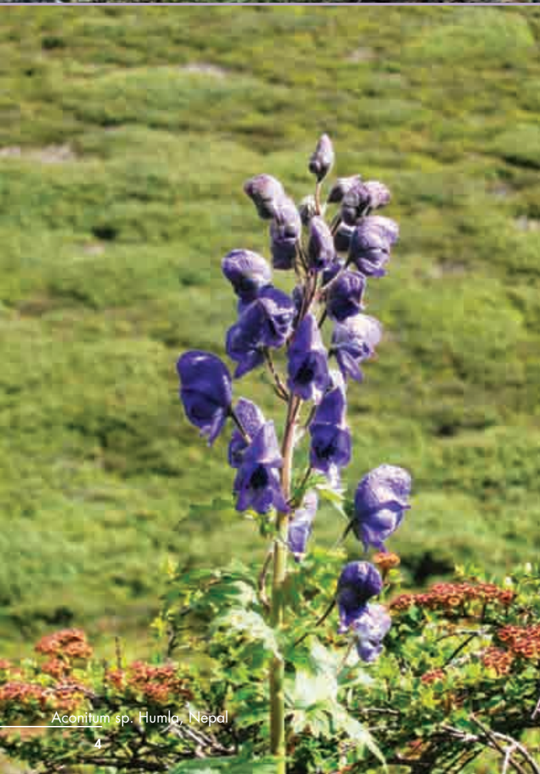
Aconitum sp. Humla, Nepal