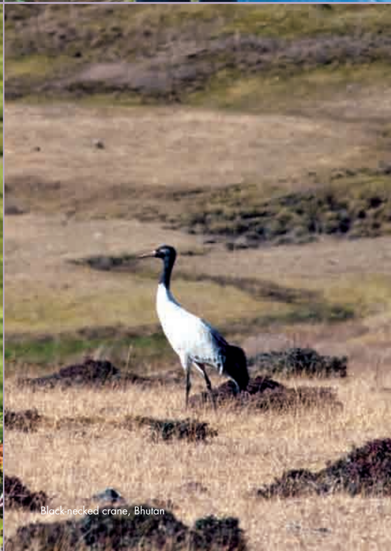
Black-necked crane, Bhutan