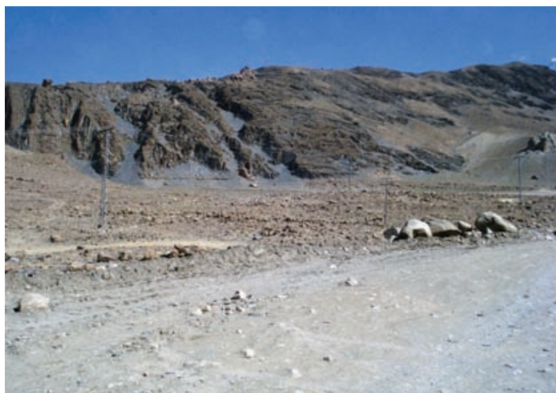
Lack of water in the canals due to glacial fluctuation resulted in complete abandonment of this village in Hunza, Pakistan.