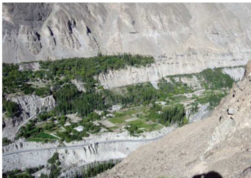
Irrigation is lifeline for arid regions. The lush greenery is the result of an extensive network of canals.

Climate change is already impacting the glacial regime in the basin. There is a general condition of glacial retreat. Although some cases of glacial advance have been reported in the high Karakorum, it is not known if these are the result of accumulation of ice mass or simply reorientation of glacial structure under a changed thermal regime. There is a great need to fill the gap in this basic understanding. Further, it is of utmost importance to assess the impacts of glacial dynamics on water availability in the region. Agriculture and other economic activities rely heavily on water, and changes in water availability can have serious impacts on the lives and livelihoods of the millions of people living in the Indus basin.