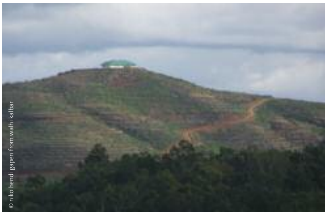
Cleared land, ready for oil palm trees, West Kalimantan.

Forest fires are also increasing, both in frequency and intensity, with disastrous consequences for both biodiversity and the world's climate: burning organic matter releases large amounts of stored carbon into the atmosphere. The fact that climate change is also contributing to this increase in wildfires is supported by recent research from the US, which shows a sudden increase in the frequency and duration of wildfires in the mid-1980s. This was particularly marked in the Northern Rockies, where land-use change is clearly not the cause, and is strongly associated with increasing spring and summer temperatures and earlier spring snowmelt.