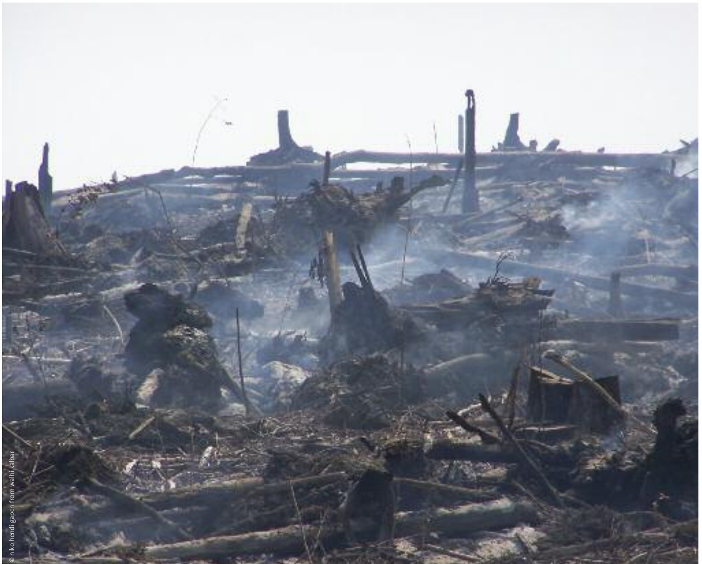
Burning down primary forests to open up a palm oil plantation in West Kalimantan.

This briefing is one of two papers from Friends of the Earth International relevant to the forests/climate nexus. The other considers the potential impacts of mechanisms intended to reduce emissions from deforestation in developing countries (REDD).