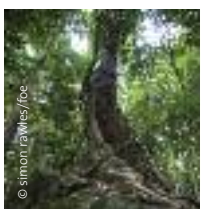
Left: Iwokrama Forest, Guyana. Right: Pine forests in Haiti.

However, it also cautions against planting with species of different provenances in anticipation of climate change, arguing that the risk of damage from spring frosts will remain, and may worsen in the case of autumn frosts (Forestry Commission, 2002).