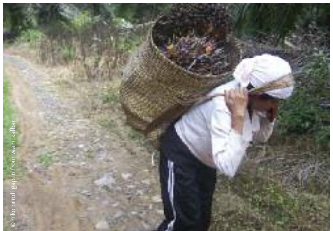
© niko bendi igapen from wainikabari