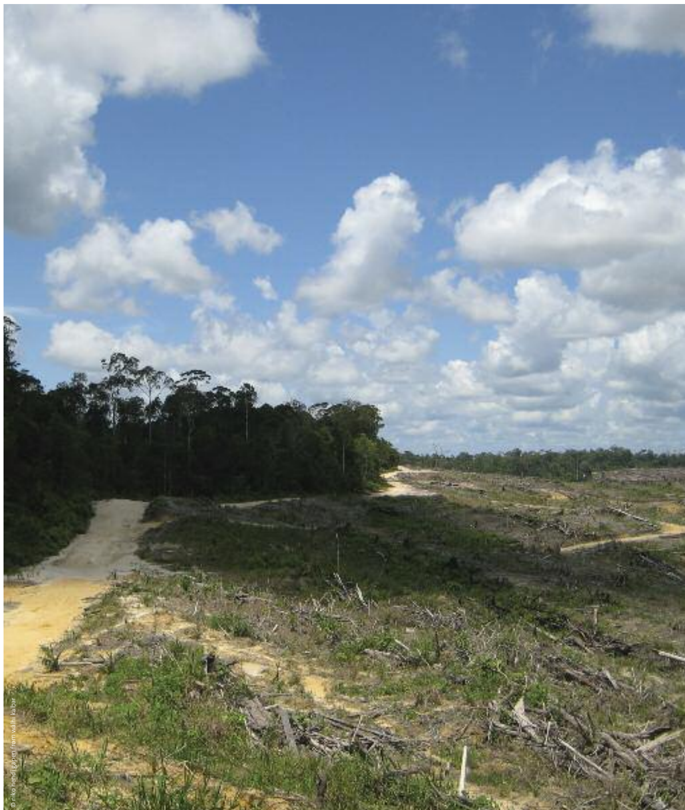
Palm oil plantation, West Kalimantan.