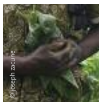
Left: Forest woman, Cameroon. Right: Woman harvesting fruit in West Kalimantan.