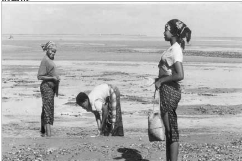
Women shellfish gleaners in Linga Linga Peninsula, Juhambane, Mozambique. The 4SSF conference will also focus on the role of women in fisheries

work primarily in English, French or Spanish, arrangements will be made to overcome language barriers through interpretation arrangements.