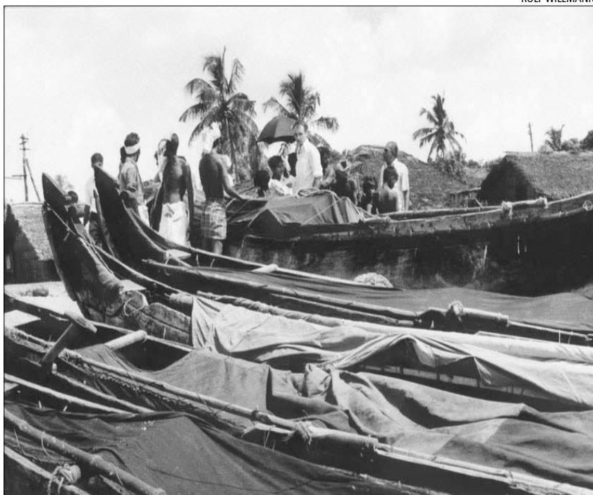
Small-scale fisheries can contribute significantly to sustainable coastal-rural development, especially in developing countries

The subject matter and focus of the Conference is of particular importance to developing countries and stakeholders from directly concerned countries are encouraged to participate. Since management issues as well as valuable experience from different systems and approaches exist also in industrialized countries, those concerned with SSF in the North and sub-tropics are also encouraged to participate.