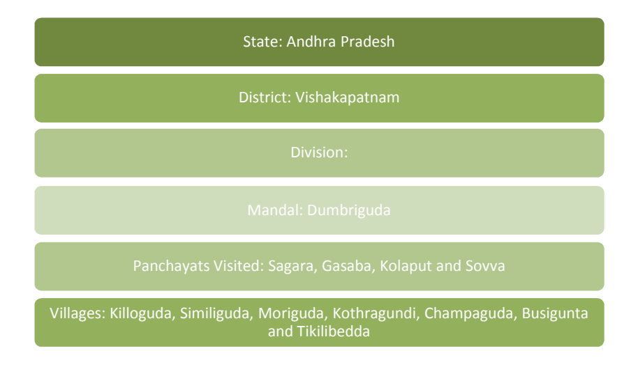
Figure: 1.2 Administration of the Area under Study