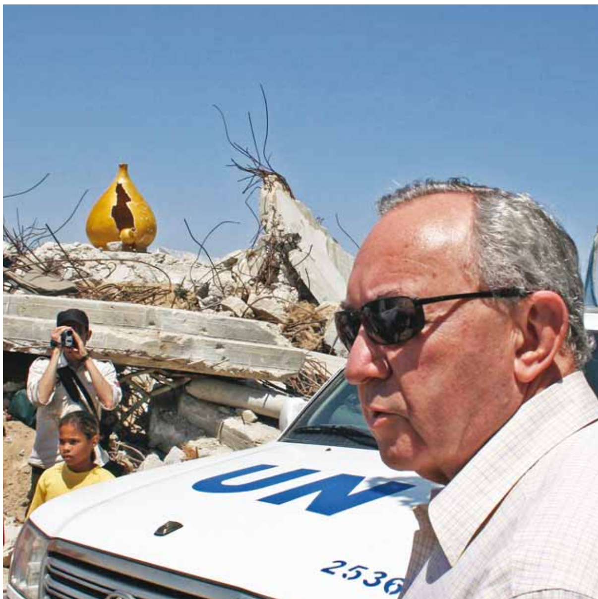
UN investigator Richard Goldstone visits a destroyed house in Gaza City

with the highest standard as an essential independent human right. Application and enforcement of these norms has grown significantly in recent years, as has the body of case law at the national level, which could inspire international jurisdictions. 285