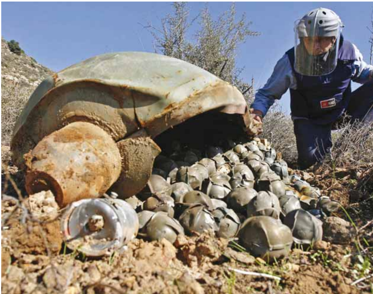
A UN Mine Action Group expert inspects a cluster bomb in the village of Ouazaiyeh in southern Lebanon