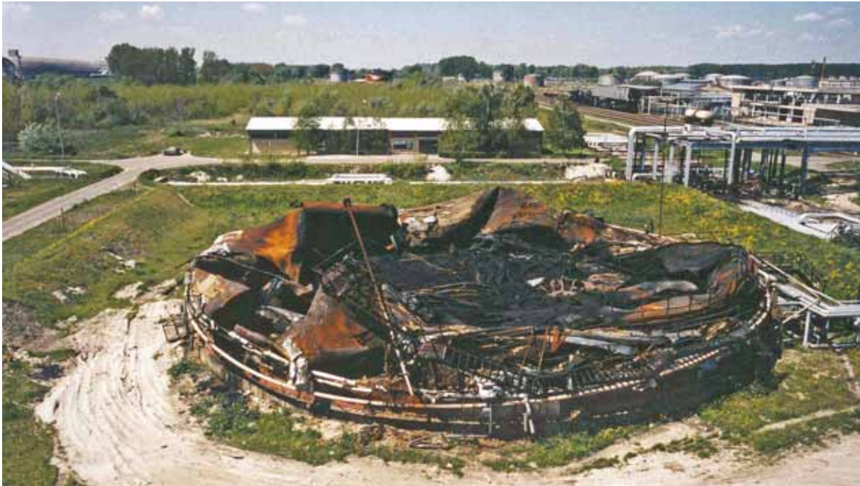
About 73,000 tons of crude oil and oil products are reported to have burned or leaked into wastewater collection canals or into the ground from the bombing of the oil refinery at Novi Sad, in Serbia