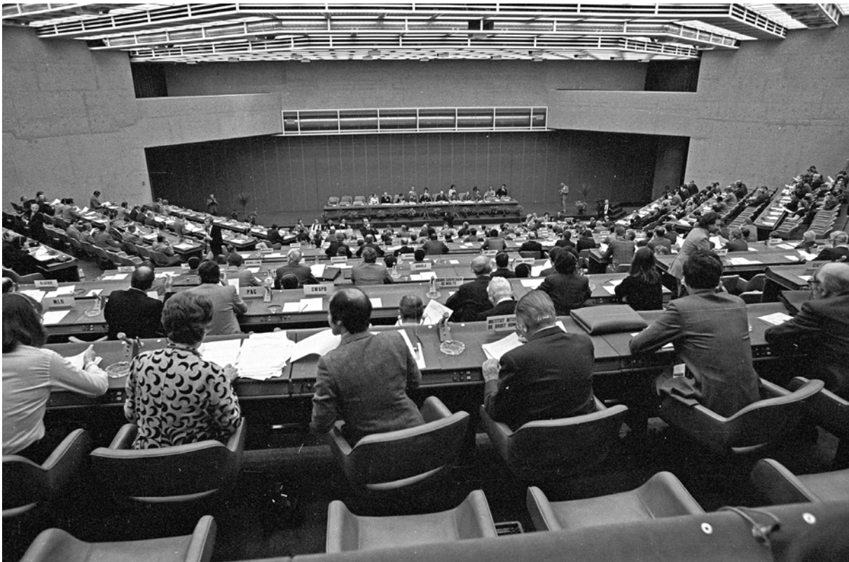
Additional Protocol I to the Geneva Conventions was adopted on 8 June 1977 by the Diplomatic Conference on the Reaffirmation and Development of International Humanitarian Law applicable in Armed Conflicts

into three main categories: those that directly address the issue of environmental protection, the general principles of IHL that are applicable to environmental protection, and the provisions that can be considered to provide indirect protection to the environment during times of conflict. 6