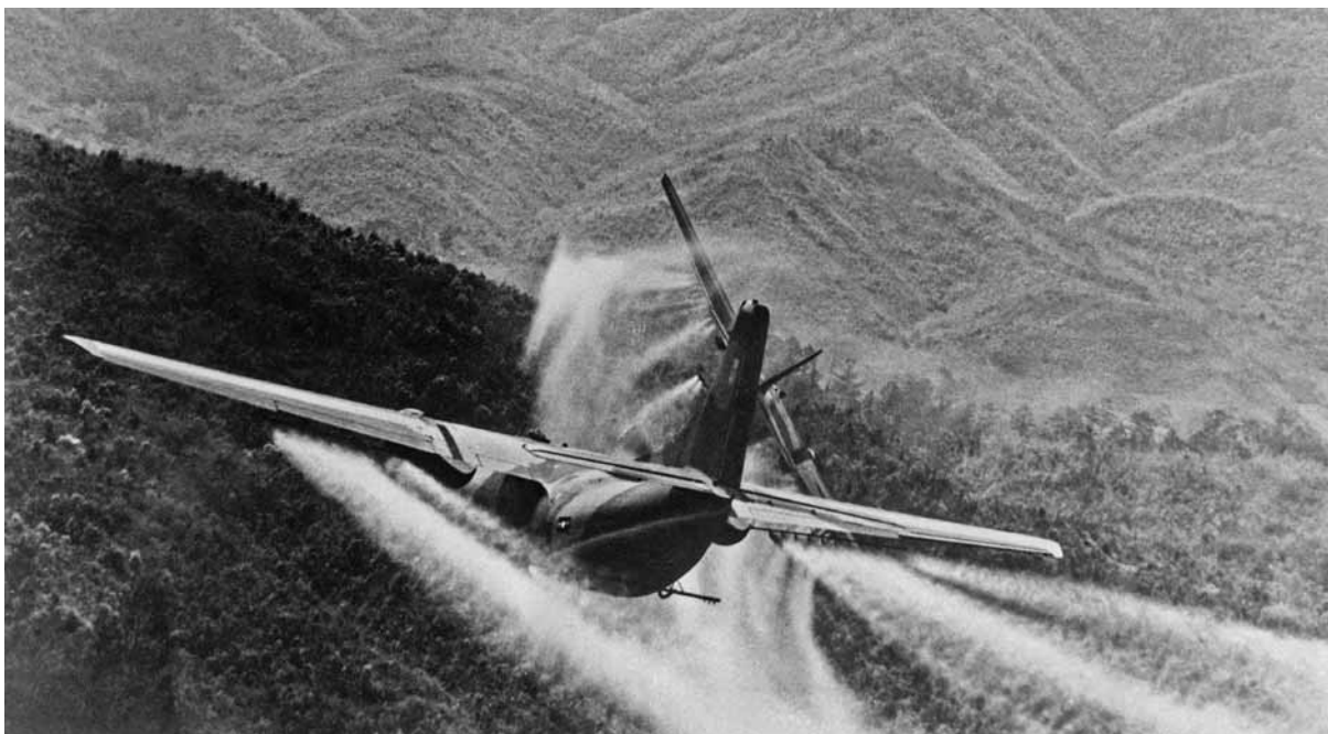
Agent Orange was sprayed over large areas during the Viet Nam War

the broader interests of the State as well as the sharing of benefits with local communities.