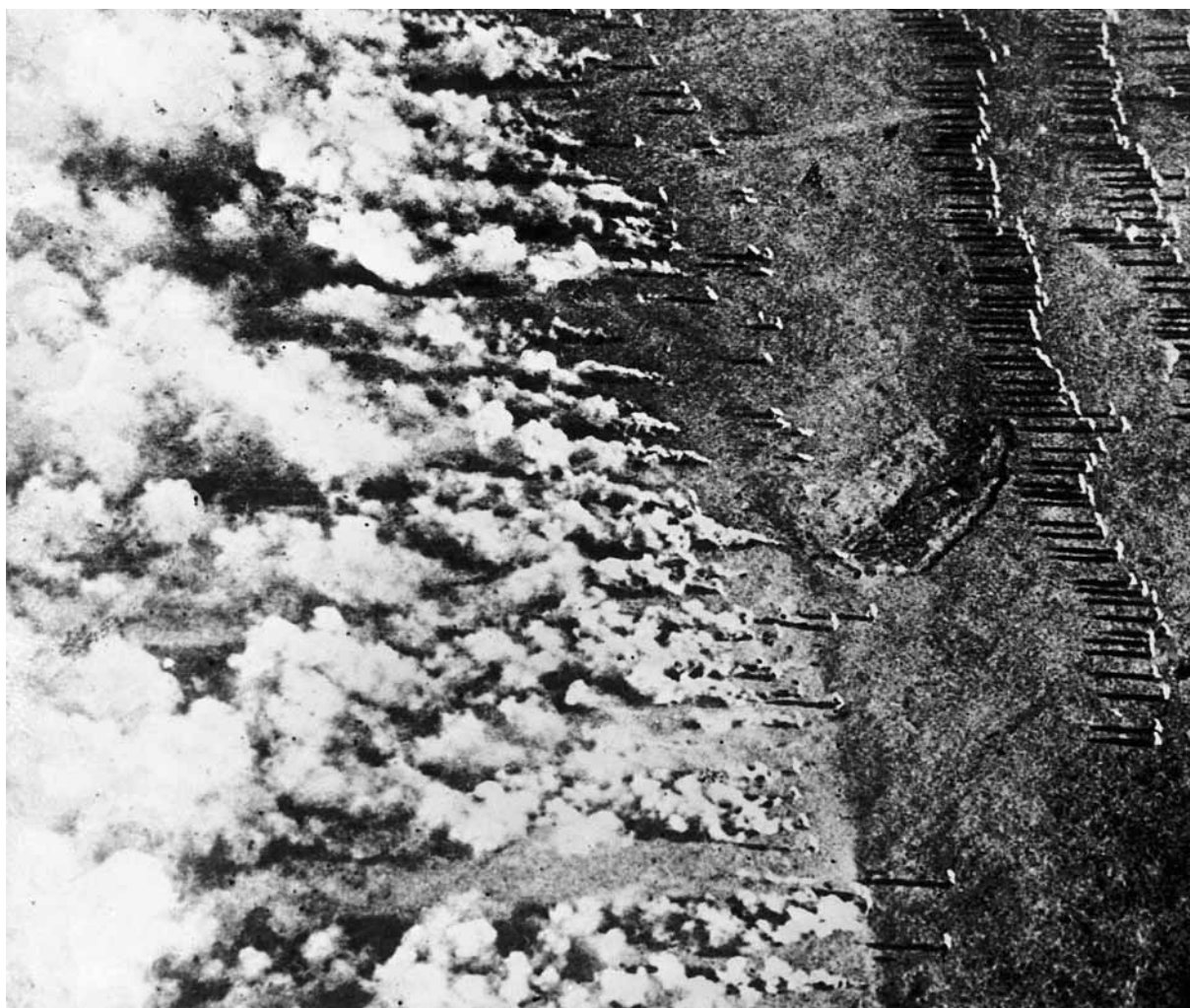
Chemical weapons were first used on a large scale during the First World War, as seen here in an aerial view of a German gas attack on the Eastern front