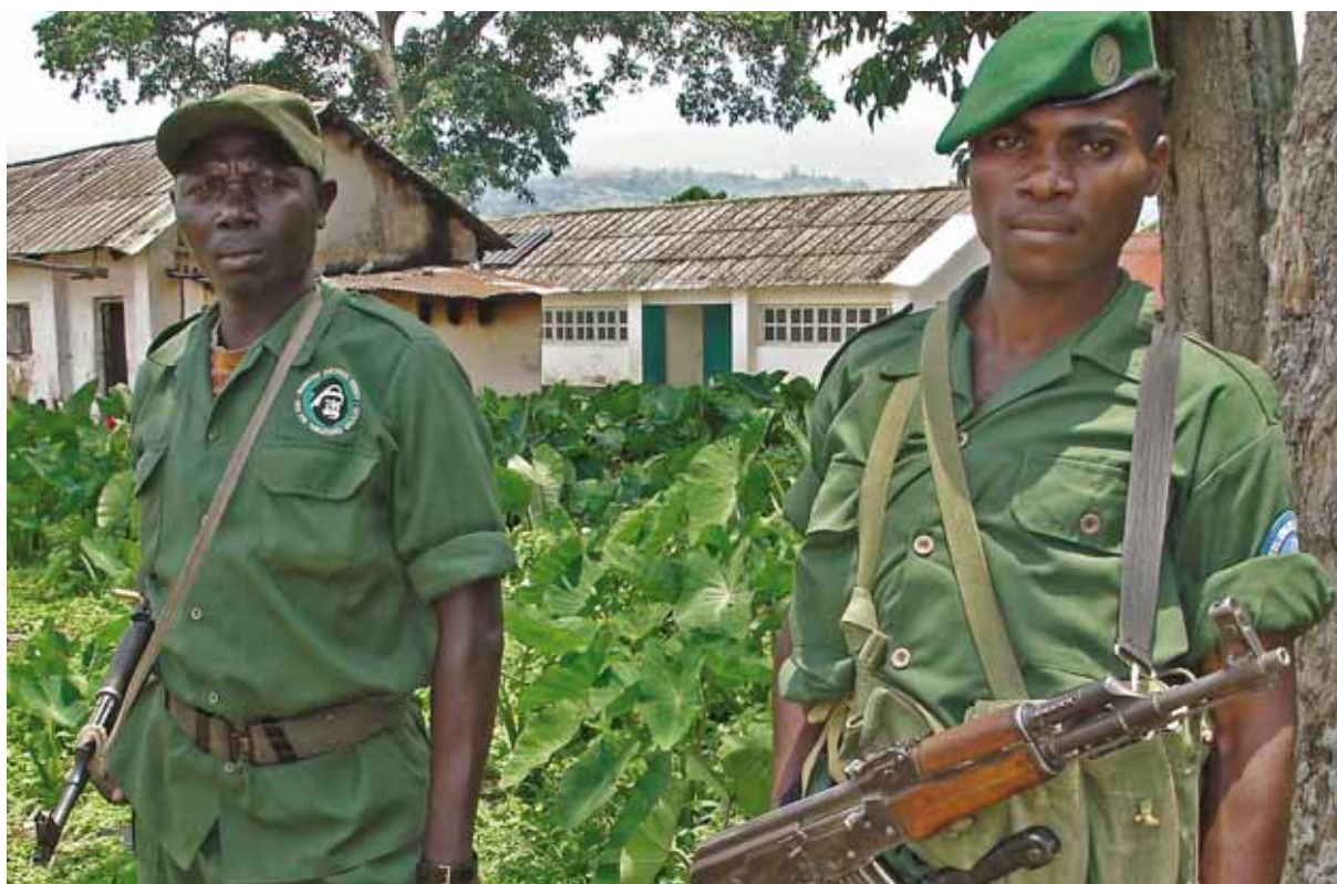
Armed wildlife guards protect Silverback gorillas from poachers in Virunga National Park, in DR Congo. This World Heritage Site has been threatened by decades of conflict in the region

The World Heritage Convention was adopted by UNESCO Member States in 1972. Through the Convention, State Parties recognize their duty to identify and safeguard for present and future generations certain places that constitute part of the heritage of humankind. 148 The Convention states that “the outbreak or the threat of an armed conflict” is sufficient to place a property on the World Heritage in Danger list. 149 Since 2007, 150 a threatened site can also benefit from a reinforced monitoring mechanism if it is at risk of losing the values for which it was inscribed on the World Heritage List. The inclusion of a provision specifically triggered by armed conflict indicates that the Convention continues to apply during hostilities.