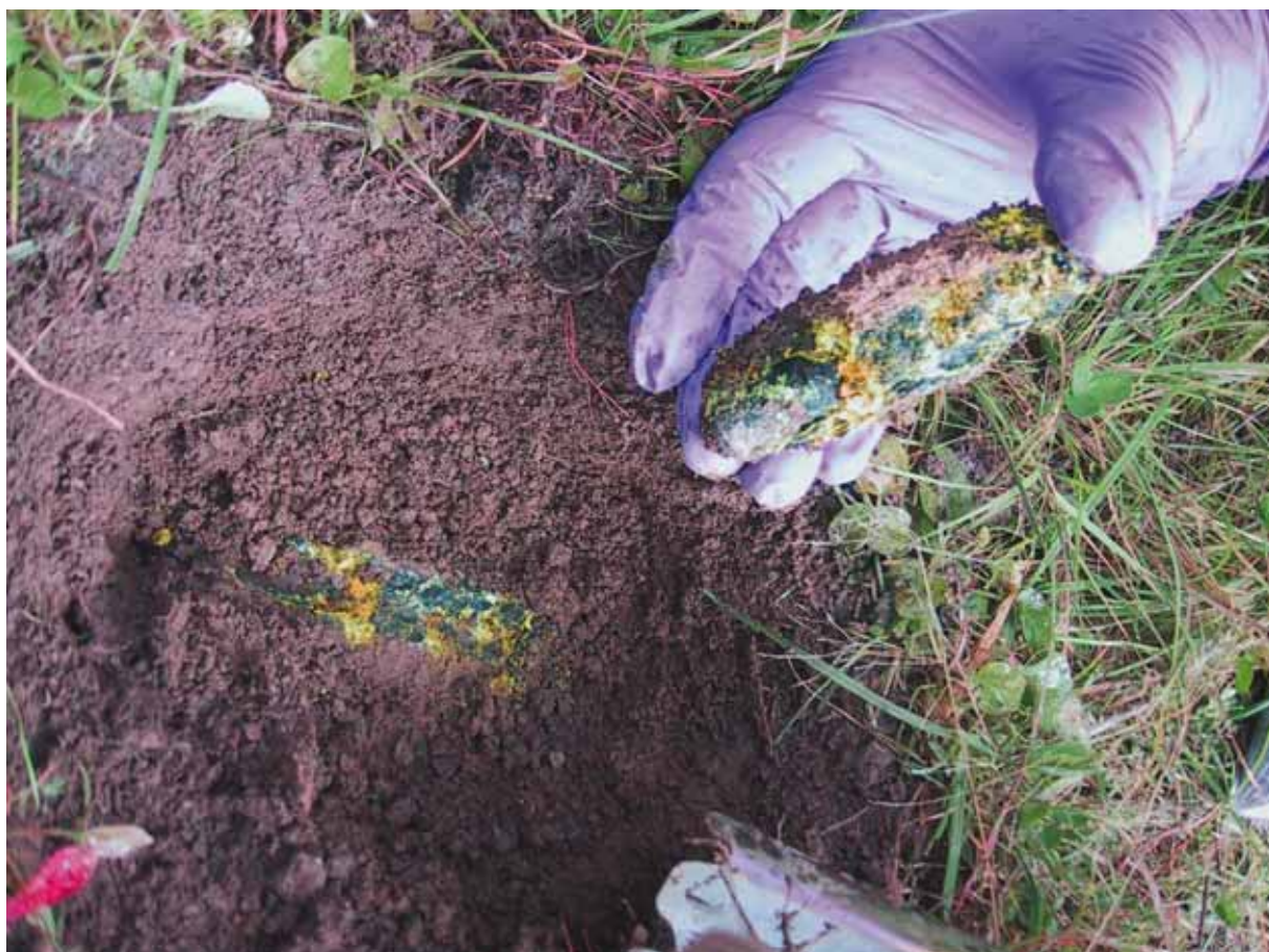
Depleted uranium penetrators can completely corrode in the soil over 25-35 years, potentially contaminating groundwater