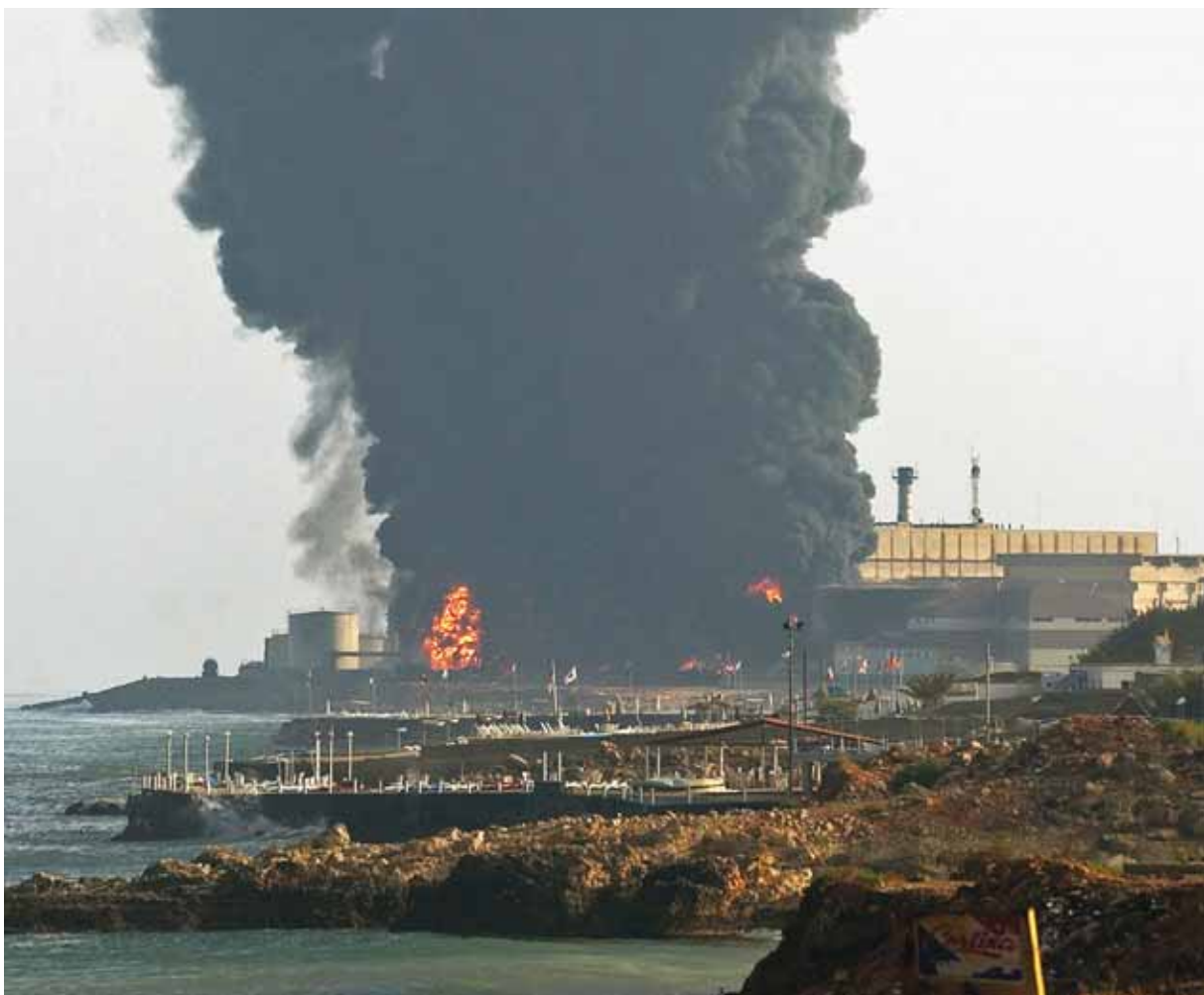
Smoke rises from the fuel tanks at Jiyeh power plant on 16 July 2006. An estimated 12,000 to 15,000 tons of burning fuel oil were released into the Mediterranean Sea

This resolution appears to open a new avenue for stronger implementation and enforcement of existing law on the protection of the environment and natural resources during armed conflict. By suggesting new means of enforcement, it implicitly recognizes the weakness of