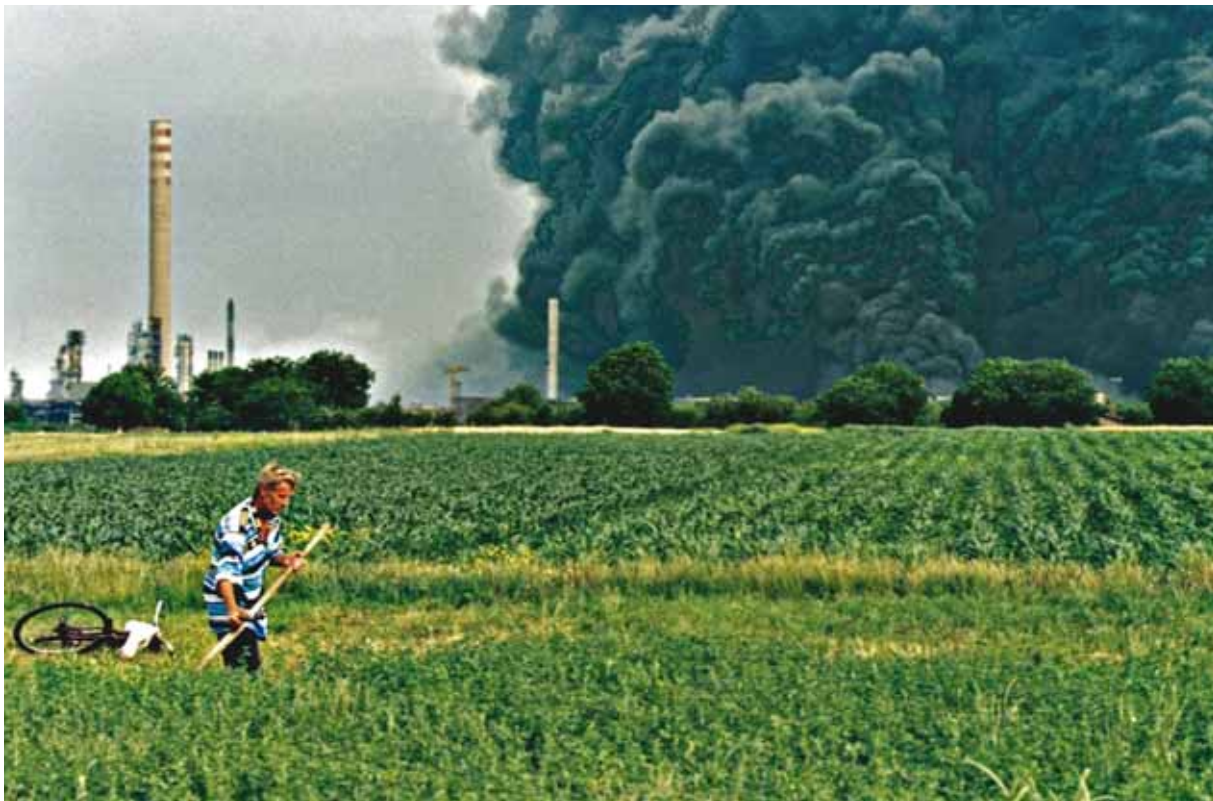
Smoke plumes rise above food crops from the bombing of the Pancevo industrial complex in April 1999

control is now part of the corpus of international law relating to the environment. 79 This principle, known as the Trail Smelter Principle, was also reiterated in the 1972 Stockholm Declaration and 1992 Rio Declaration (see Chapter 4 for a detailed discussion). The ICJ acknowledged that the principle now constitutes customary international law. Second, the Court instructed States to account for environmental considerations when determining what constituted necessary and proportionate levels of military action. 80 Third, the Court concluded that the threat or use of nuclear weapons “would generally be contrary to the rules of international law applicable in armed conflict, and in particular the principles and rules of humanitarian law,” 81 as such weapons were considered to be indiscriminate and non-proportional in application. Finally, the ICJ handed down a non-liquet 82 on the question of the use of the nuclear weapon in self-defence (put forward by the United Kingdom), due to gaps in the law.