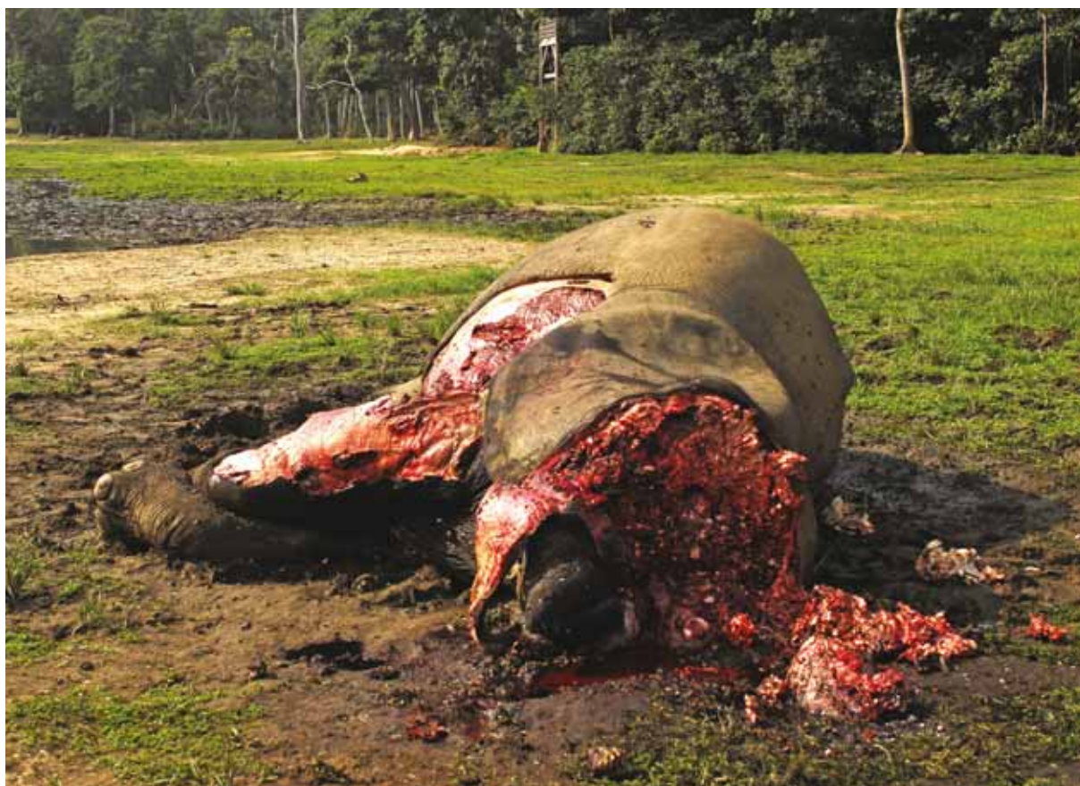
Every year, large heavily armed groups enter the Central African Republic from neighbouring areas to plunder its wildlife resources, in particular elephant ivory

Other MEAs specifically state that they are automatically suspended, terminated or inapplicable once armed conflict has begun. Still others remain silent on the issue. Of the MEAs analysed below, a small number (less than 20 percent) clearly state their discontinuance during armed conflict. The remaining 80 percent are roughly evenly divided between those containing language that might directly or indirectly bear on their continuance and those that contain no such language at all. It is important to note, however, that in most cases, whether the provisions apply depends largely on the methodology adopted to determine when IEL remains in force during armed conflict.