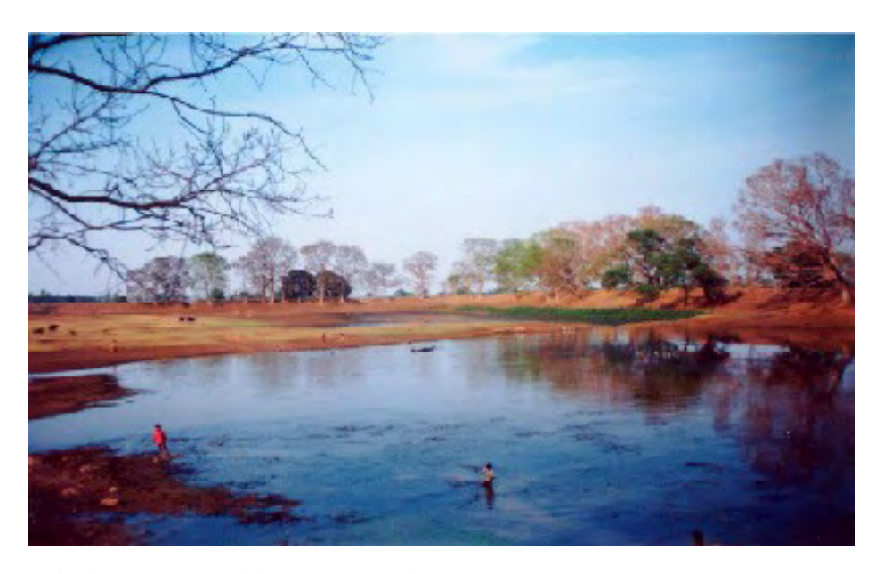
A silted up traditional tank with large trees on the embankment; District Bilaspur, Chhattisgarh, India