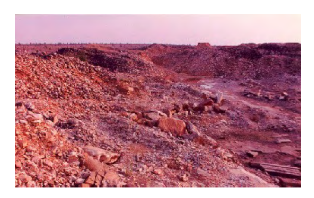
Mine spoil left in situ after the extraction of economically useful material; Kota, Rajasthan, India

To the extent possible, mine spoils need to be leveled or terraced in order to provide suitable substratum. Leveling will vary according to the type of mine, methods of mining and the way in which a particular area has been worked. For instance, in case of surface and opencast mines the procedures will be leveling and fencing of the area. In case of shaft and underground mines although overburden can be treated in similar fashion but mined out areas and abandoned mines will have to have different strategy depending upon the context. Mined out areas in hillside slopes may require contour dikes. Leveling will provide a base of coarse material over which to spread sediment. Some of the large mining pits that have developed into reservoirs can be developed as water-bodies aesthetically appealing for ecotourism and simultaneous fish culture to support local livelihoods.