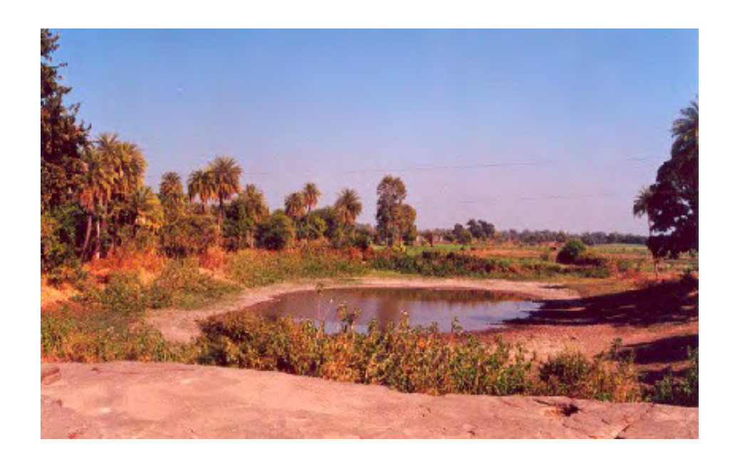
A traditional pond silted-up due to sedimentation; District Bhopal, Madhya Pradesh, India