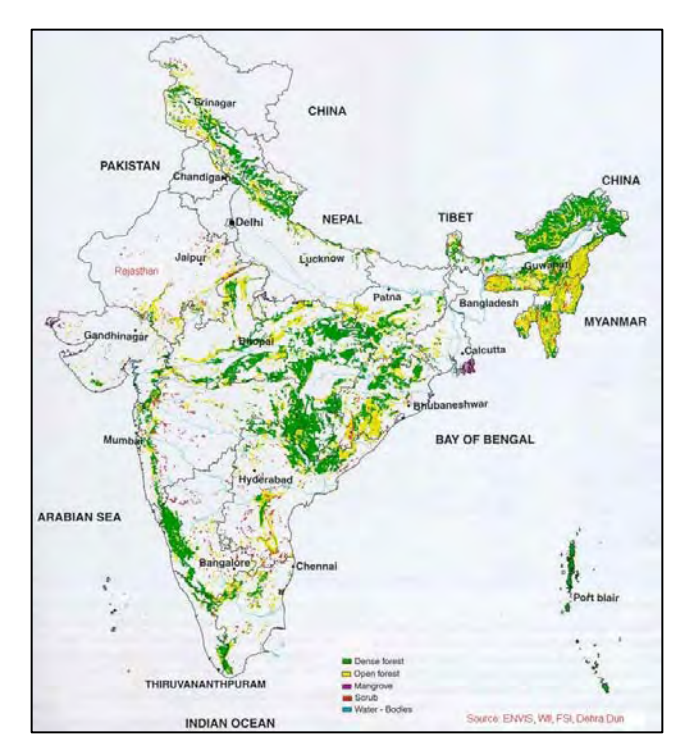
Forest cover in India: Note the scarce vegetation cover in Rajasthan