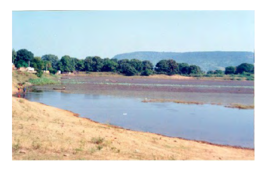
Traditional tank with cultivation of aquatic nuts and mango trees on the banks; District Satna, Madhya Pradesh, India