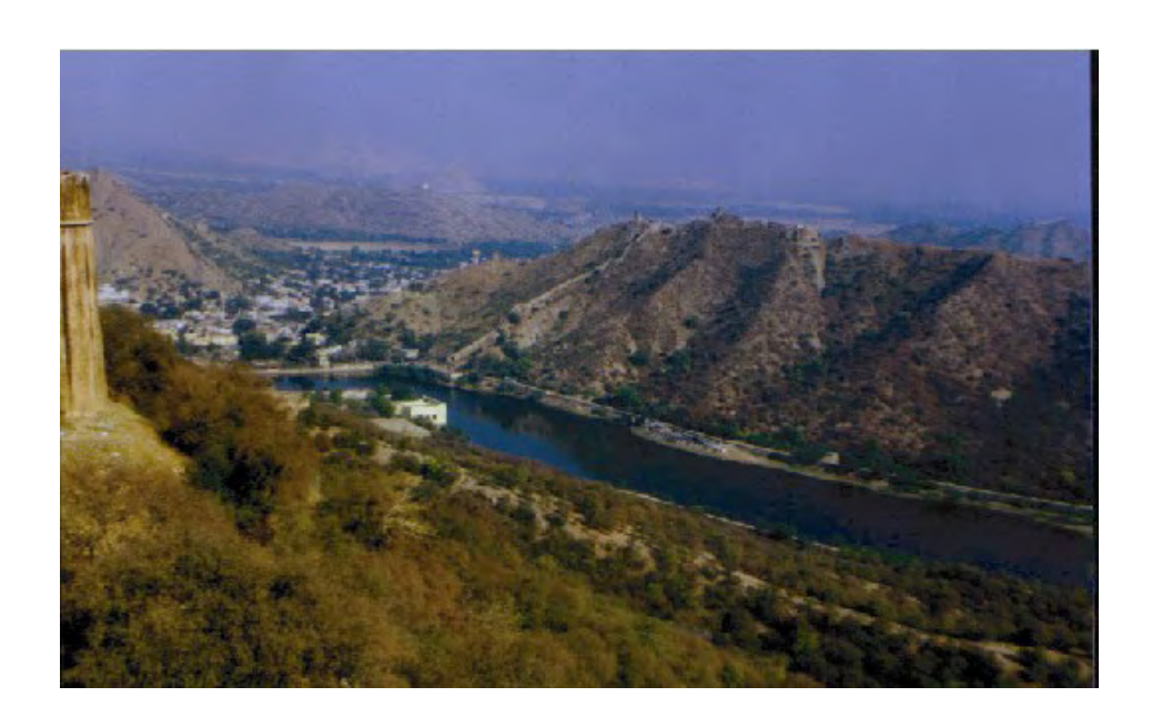
Traditional tank constructed in a valley that is now heavily urbanized; Jaipur, Rajasthan, India