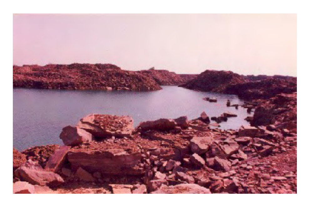
Mine pit reservoir; Kota, Rajasthan, India