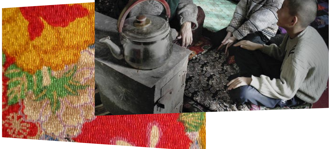
Altyn Musakova talking with her grandchildren in Kyrgyzstan.

In the rural areas, older people use cow dung and wood cut from their gardens. Winters last for several months, and the temperatures routinely fall below -15°C. Energy shortages make it hard for older people to heat their homes. Older people and small children are especially at risk of illness during the cold months, due to weaker immune systems. During these months, older people often stay in bed, only leaving their homes when they absolutely have to.