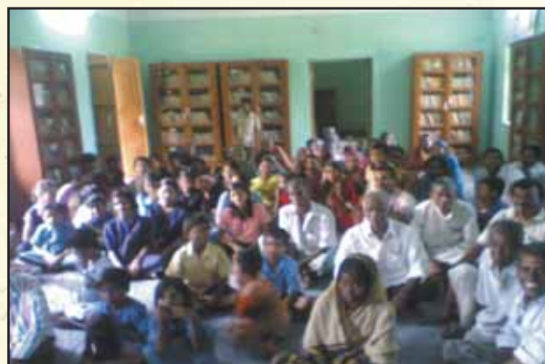
Men and women of DMC & DMT during a sensitization workshop