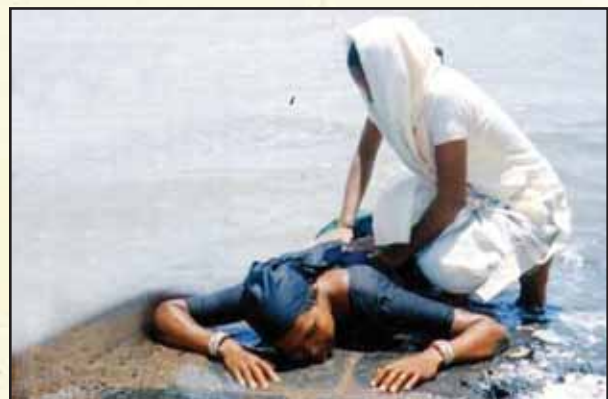
Women's participation in First Aid and Search and Rescue Trainings