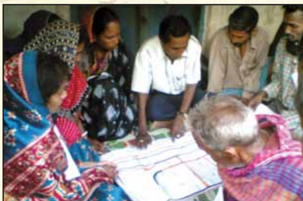
Women involved in resource mapping

It is noticed that women's participation is relatively high in states of Assam, Gujarat, Meghalaya, Tamil Nadu, Tripura and Uttaranchal. Moderate levels of