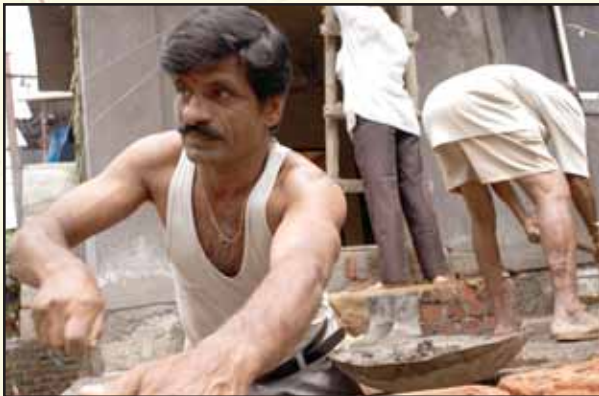
The Masons Training Programme has been one successful initiative under the GOI-UNDP DRM Programme along with training Programs on fire fighting, search and rescue in schools.

houses. After receiving training for 6 days, masons build a Technology Demonstration Unit in each of the 201 blocks which will then be used as a control room cum information centre. The training for these master trainers is provided by resource persons from ODTF team. Masons and artisans are now part of self help groups and masons' cooperatives in each block. Control Rooms have also been set up in Blocks which will help in the dissemination of safe building techniques.