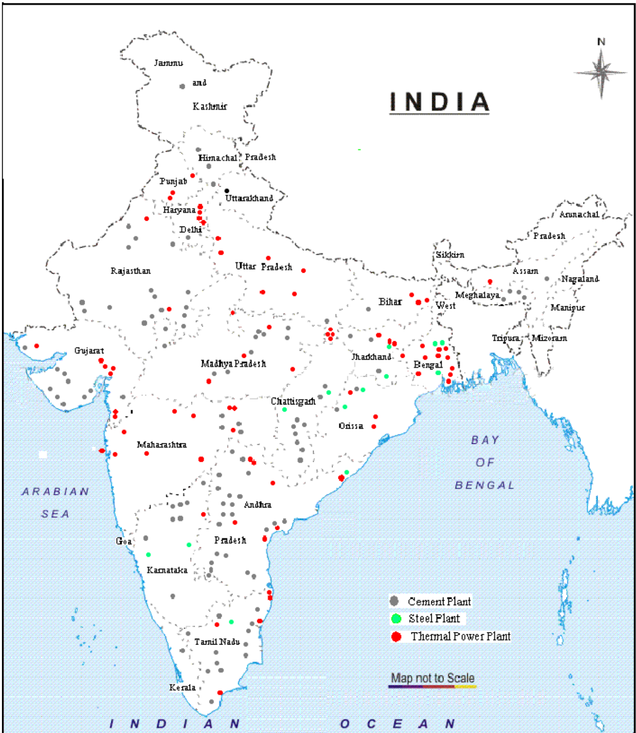
Locations showing Cement, Steel and Thermal Power Plant of India