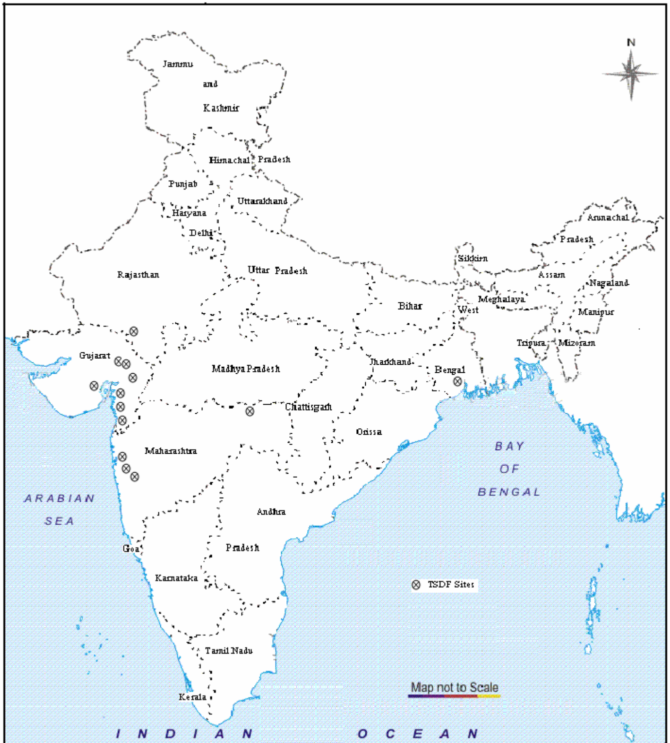
Locations showing Common Hazardous Waste Treatment & Disposal Facility (TSDF)