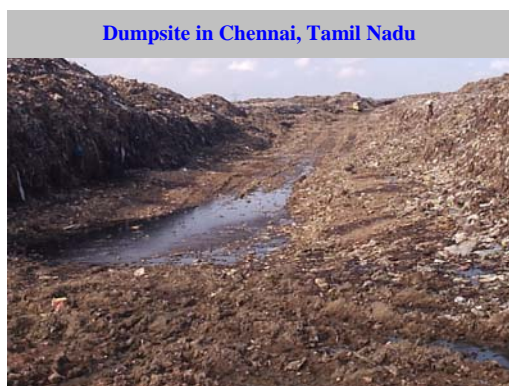
Dumpsite in Chennai, Tamil Nadu

at Perungudi is at the Pallikaranai swamp area, which also houses a large number of species of plants and animals. Dumping had been taking place in this area for more than 15 years and almost 25 per cent of the marshland has been lost due to indiscriminate dumping. A study by the PCB in 2005