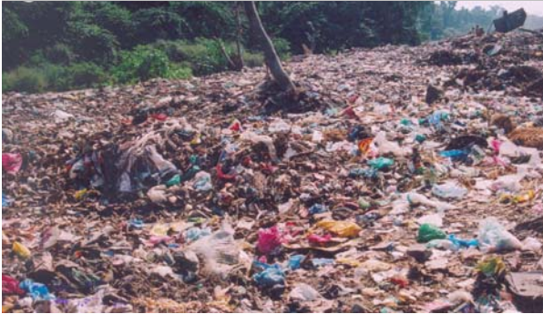
Plastic waste mixed with other waste in Uttarakhand

Since it is not specified what kind of action is required to be taken by DMs/DCs for the enforcement of the rules, as such, action taken by them was difficult to verify in audit. In most of the cases, orders/ circulars were issued for the enforcement of these rules and no follow-up was done to check the implementation of these orders/ circulars.