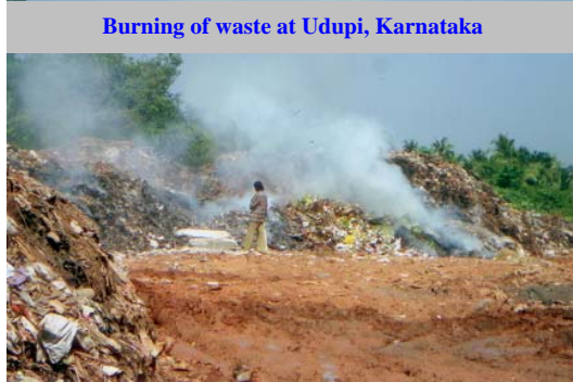
Burning of waste at Udupi, Karnataka

manufacturing compost by utilising the municipal solid waste from Bangalore City area. It had an installed capacity of 300 tonnes per day but was operating at only 150 tonnes per day. It was seen that the compost plant received more than 300