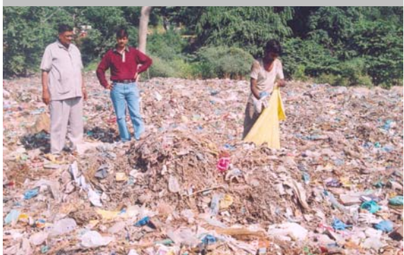
Plastic waste mixed with other waste in Uttarakhand

Commissioner of the concerned district. Further, according to Rule 4, no vendor shall use carry bags and containers made of recycled plastic for storing, carrying, dispensing or packaging of foodstuffs. Rule 6 stipulates that recycling of plastics shall be undertaken strictly in accordance with the Bureau of Indian Standards specification and Rule 8 states that no person shall manufacture carry bags or containers irrespective of its size