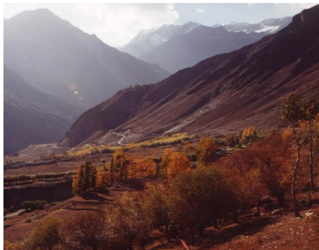
Willow Mortality in Lahaul

The willow species is one of the most important species with the multi-faceted uses to the local populace of Lahaul Valley. However, the large scale mortality of Willow in Lahaul in the recent past became a matter of prime and immediate concern and caught the attention of the people and the government of Himachal Pradesh as it is considered as the lifeline for the local populace.