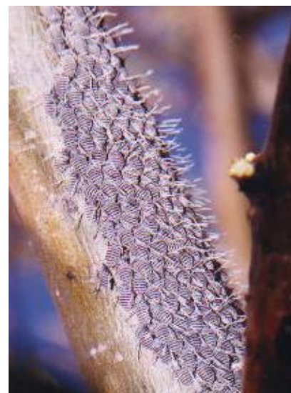
Giant Willow Aphid Infestation on Salix