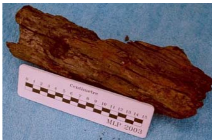
Figure 2. Wood log obtained from the Uti ancient gold mine.

observed that these old workings were stretching up to a depth of 20–25 m, and contained wood, charcoal, ash, pottery, etc. The geological cross-section of the open-pit (Figure 1 b) shows presence of amphibolites in its western face, acid volcanic rocks in its eastern section, and the lode zone. Mineralization in the mafic rocks is mainly confined to intensely silicified and feldspathized amphibolite with thin stringers, veins and veinlets of quartz, associated with the sulphides (pyrite, arsenopyrite, pyrrhotite, etc.). Mineralization is notable with a uniform impregnation of silica in the ore zone. A wood log was collected from the mineralized zone. On the basis of presence of wood, charcoal, ash, pottery, etc. in the old workings, it was interpreted that ancient miners extracted the ore through fire-setting process followed by water-cooling of the heated rock. This was evident from the presence of visible gold over the surface of charcoal coated burnt quartz in the open pit old workings 8 .